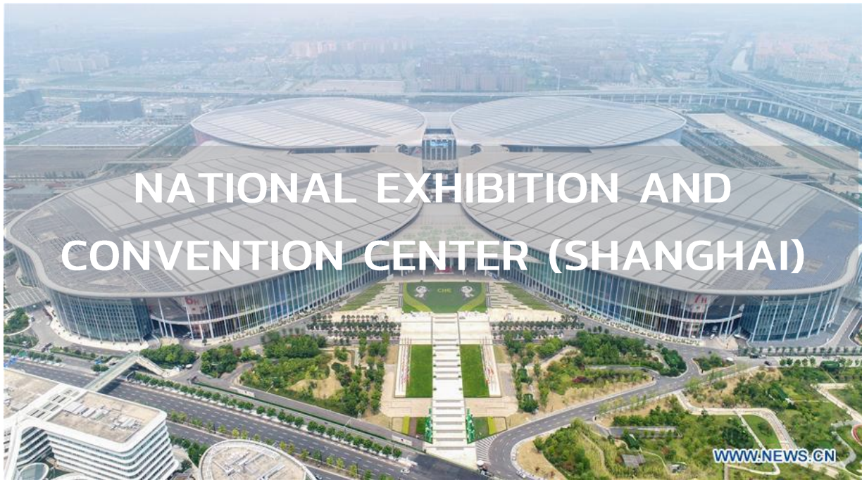
Aerial photo taken on July 28, 2020 shows the National Exhibition and Convention Center (Shanghai), the main venue of the 3rd China International Import Expo (CIIE), in east China's Shanghai.