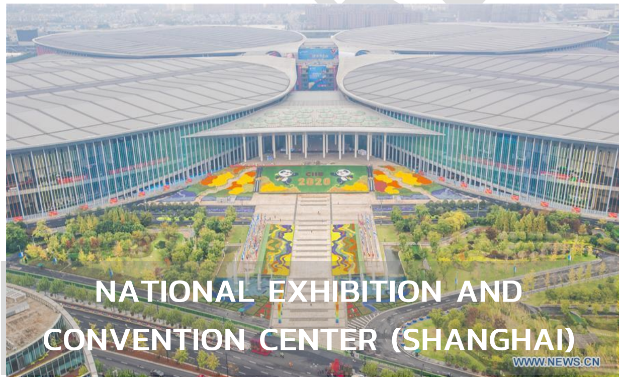
Photo taken on Nov. 3, 2020 shows a view of the National Exhibition and Convention Center (Shanghai), the main venue of the 3rd China International Import Expo (CIIE), in east China's Shanghai.