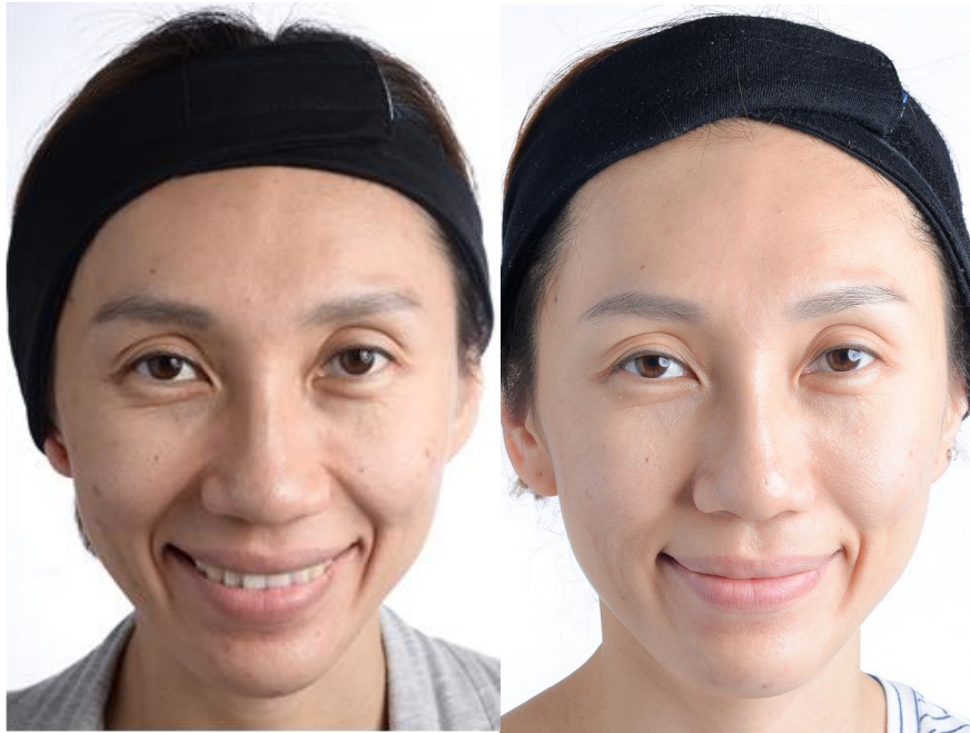
Figure 5. Before(left) and after(right) pictures of VHPCC participant (frontal, smile) showed less wrinkles around eyes area, crow's feet, less dark circles under eyes. Besides, nasolabial folds were improved. Facial skin looked rejuvenated and hydrated with brighter and smoother appearance. The face also looked more volumized.