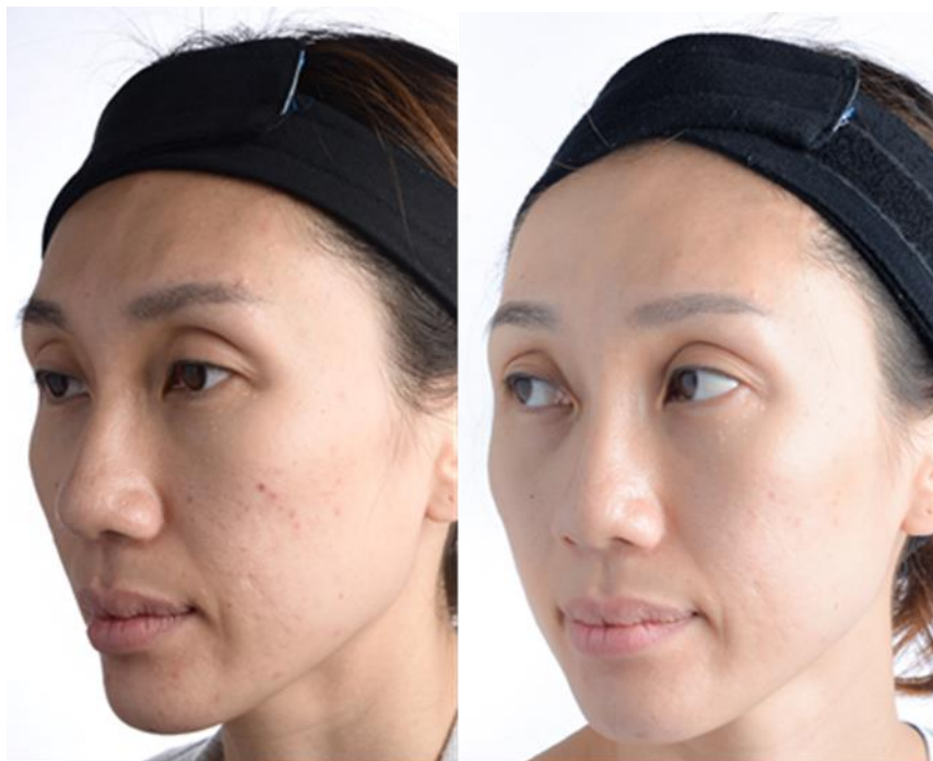
Figure 4. Before(left) and after(right) pictures of VHPCC participant (left oblique, at rest). The after picture showed facial skin looking more volumized especially at forehead and cheeks. Facial skin looked rejuvenated and hydrated with brighter and smoother appearances. Besides, nasolabial folds were better. Acnes and acne redness spots were much improved without permission of using any drugs or treatments.