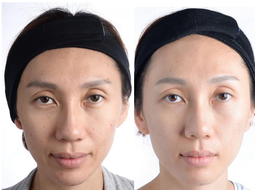
Figure 2. Before(left) and after(right) pictures of VHPCC participant (frontal, at rest). The after picture showed facial skin looking more volumized, rejuvenated and hydrated with brighter and smoother appearances, and decreasing wrinkles. Under eyes area was brighter. Besides, nasolabial folds were better. This participant stated that she felt like she had received Botox, filler injection and laser treatment.