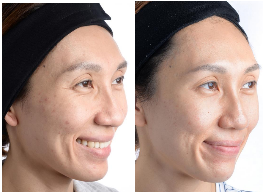
Figure 6. Before(left) and after(right) pictures of VHPCC participant (right oblique, smile) showed less wrinkles, crow's feet, and improved under eye area. Besides, nasolabial folds were improved. Acne redness spots and scar on the cheek were much improve without permitted using any drug or treatment. The face looked volumized, rejuvenated and hydrated with brighter and smoother appearance.