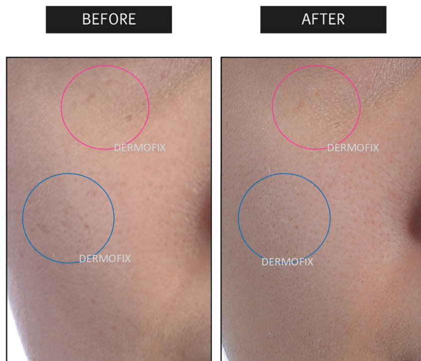
Figure8. Before(left) and after(right) picture set of VHPCC participant. The after picture showed pigmented spots were less and pigmented spot color was lighter.