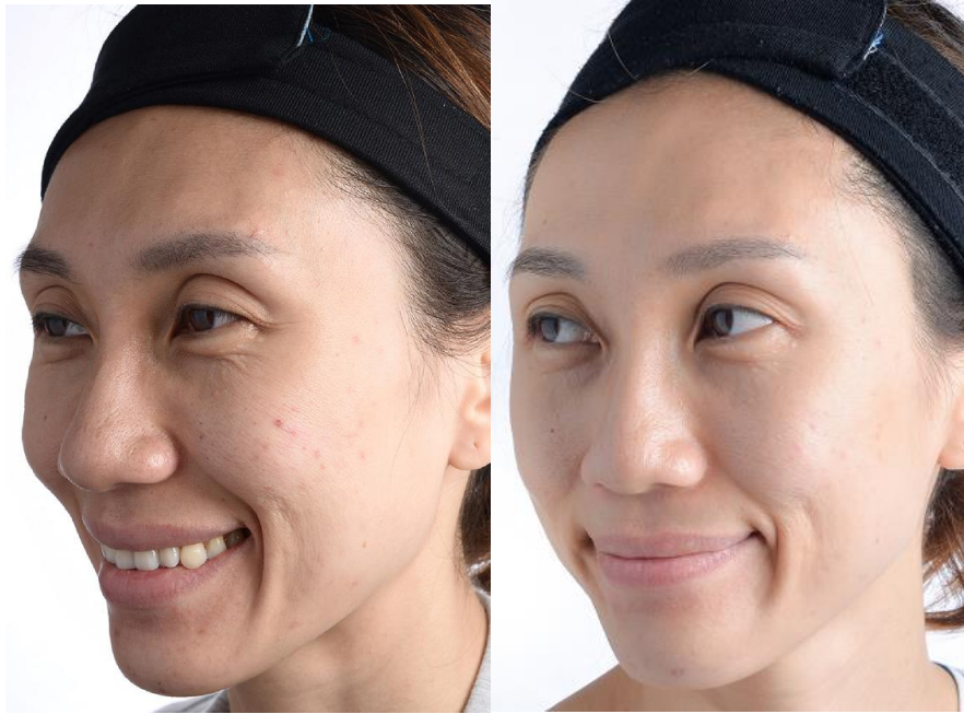
Figure 7. Before(left) and after(right) pictures of VHPCC participant (left oblique, smile) showed less wrinkles, crow's feet, and improved under eye area. Besides, nasolabial folds were improved. Acne redness spots and scar on the cheek were much improve without permitted using any drug or treatment. The face looked volumized, rejuvenated and hydrated with brighter and smoother appearance.